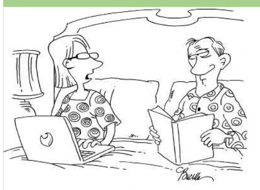
"Have you ever thought of having yourself digitally restored?"

Interestingly, a study in 1976 published in Science magazine speculated that the girls might have had convulsions because of a fungus found in cereals. Toxicologists say the fungus can cause delusions, vomiting and muscle spasms.